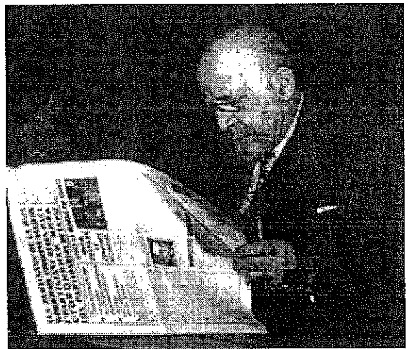
W.E.B. Du Bois