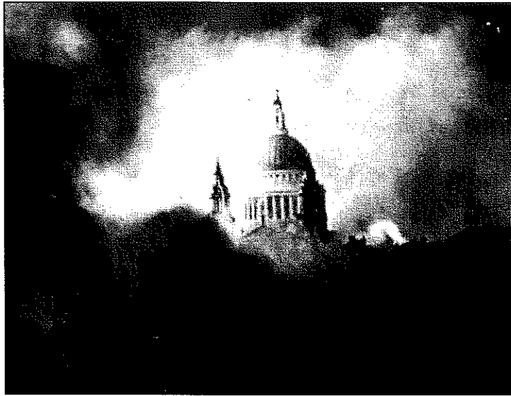
NATIONAL ARCHIVES AND RECORDS ADMINISTRATION

Almost at once the Battle of Britain began. As many as a thousand German planes a day flew over Great Britain, bombing and killing. British pilots, outnumbered by as much as twenty to one, attacked the Germans again and again. German losses became so great that the bombing of Britain ended.