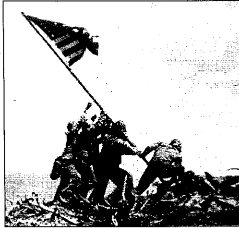
Flag raising on Iwo Jima, February 23, 1945

Then, President Harry S Truman received word that the atomic bomb was ready for use. On August 6, 1945, an atomic bomb was dropped on the Japanese city of Hiroshima. This was the first atomic bomb used in warfare. The bomb totally destroyed about five square miles of the city. Between 70,000 and 100,000 people died in the explosion. Thousands more died later from radiation sickness. On August 9, a second atomic bomb hit Nagasaki. Shortly thereafter, the Japanese surrendered.