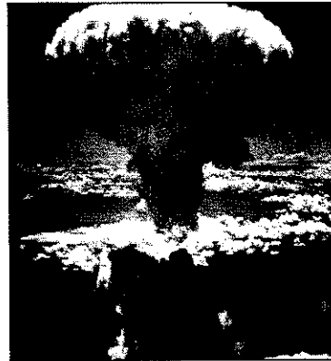
Bombing of Nagasaki